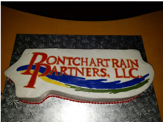
Cake created by Haydel's Bakery